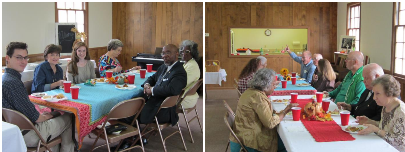
The New Market Presbyterian Church Lunch Bunch

Once again, New Market Presbyterian Church enjoyed fun and fellowship at Family Luncheon! At the request of a few folks, a copy of the Un-Stuffed Bell Pepper Casserole is printed below.